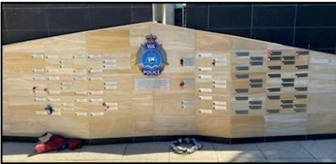
WA Police Force Memorial Wall at the WA Police Academy in Joondalup